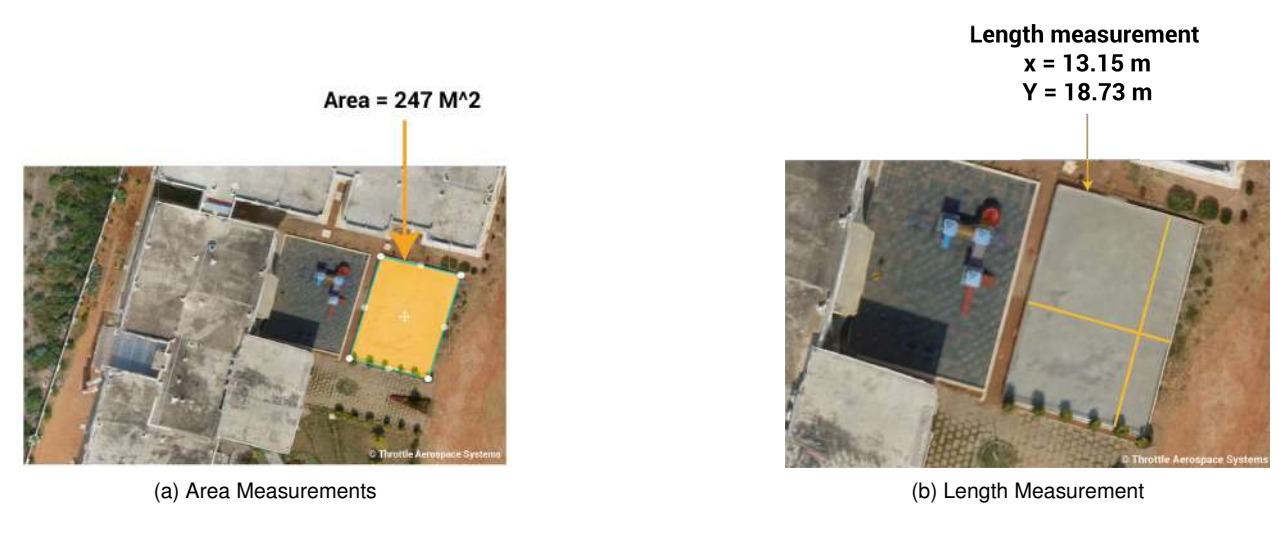
Figure 9: Area and length measurement of the constructed building using TAS UAS