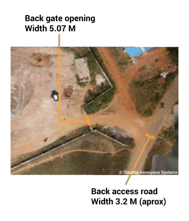
Figure 8: Back access road width