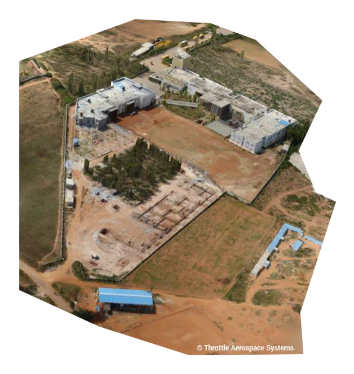
Figure 13: 3D Image of the Construction Area