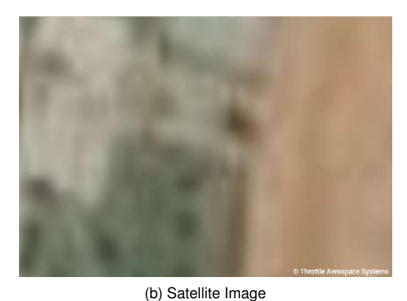
Figure 6: UAS data at 4x Zoom compared with satellite data