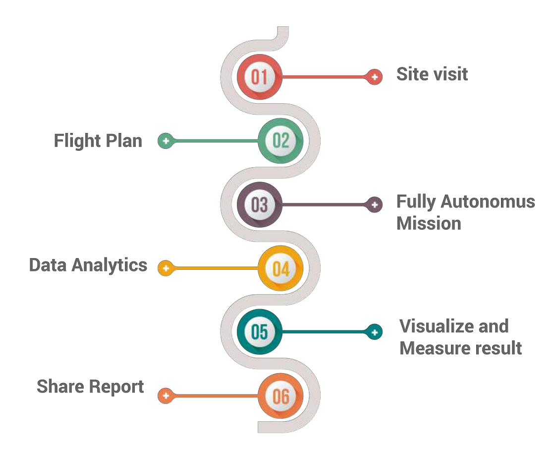
Figure 1: Processing Steps