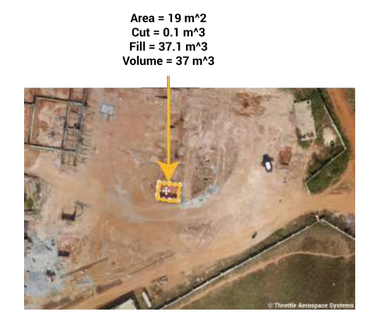
Figure 10: Pit volumetric measurement