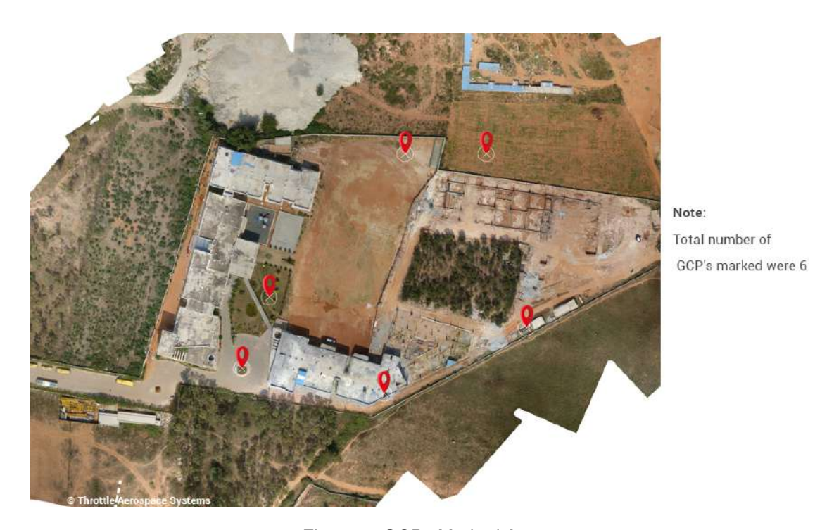
Figure 3: GCPs Marked Area