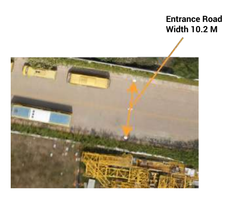
Figure 7: Entrance Road width

With the help of processed data, we measured the width of the access road and the back road.